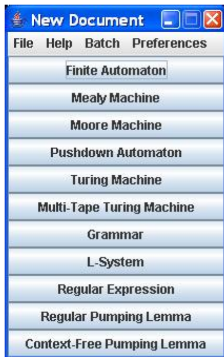
Figure 1.1: JFLAP Menu.

with the text. JFLAP can be used with other texts, but adjustments have to be made for possible differences in notation and approach.