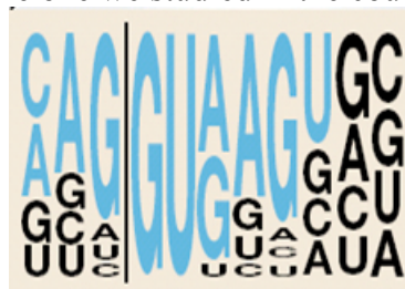
5' splice site

Compare the logo obtained with the one we studied in the course reproduced here: