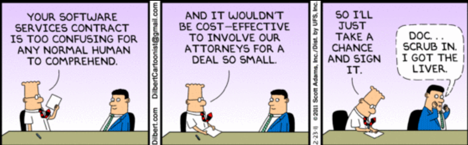
Dilbert, by Scott Adams